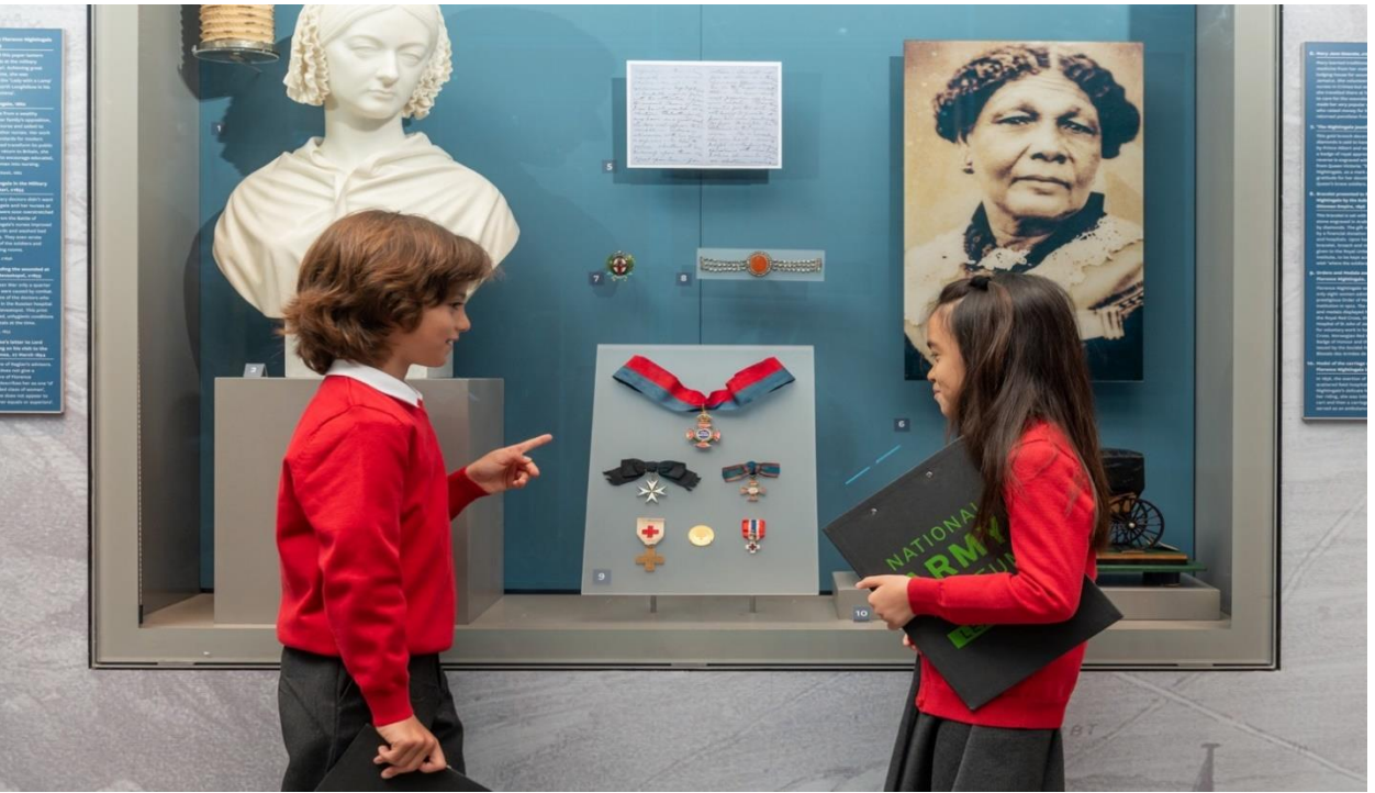
Key Stage One students studying some of the Florence Nightingale and Mary Seacole Collections

The last year saw the on-site formal learning visits stabilise with the only restriction being available space for learning sessions thus the number of physical visits was slightly down on the previous year at 4,002 but there was a great increase in virtual sessions given by the Learning Team up from 5,033 to 9,169. The digital delivery methods established during Covid lockdown and the physical visits figure is considerably more than the less than 4,000 combined figure pre Covid. The Learning Team continues to produce new resources for secondary schools.