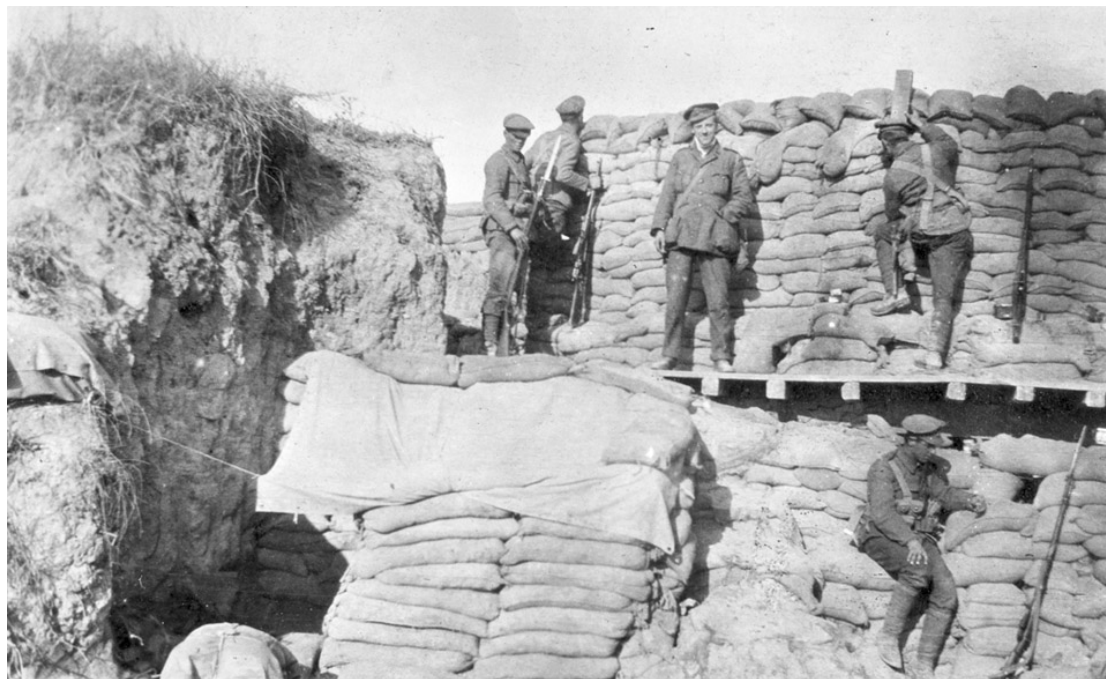
Fortifications on the Gallipoli peninsula, 1915.

ANZACs, but they stubbornly refused to be moved, clinging determinedly to the cliff tops.