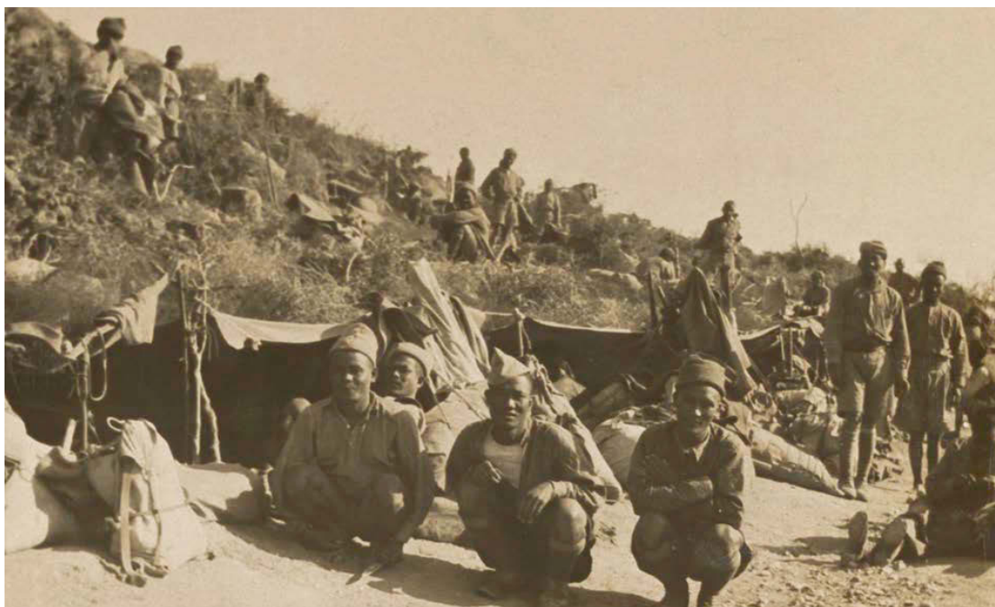
'5th Gurkhas', Gurkha Rifles in bivouacs (a temporary camp without tents or cover), Gallipoli, 1915

37 Victoria Crosses were awarded during the Gallipoli Campaign, including 23 to British soldiers, 9 to Australians, 4 to Irishmen, and 1 to a New Zealander. Six of the British VCs were awarded for actions during the landing of the 1st Battalion, the Lancashire Fusiliers on 'W' Beach, Cape Helles, who came ashore under heavy fire and suffered 700 casualties on that first morning. Their actions led to the famous expression "Six VCs before breakfast".