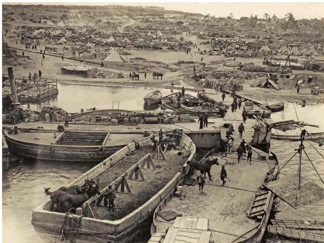
'V' Beach from the 'River Clyde', Dardanelles, 1915.

peninsular to prevent reinforcements from arriving from the north, whilst the main British force captured all of the powerful defensive fortresses along the Dardanelles coast. From there, an advance up the peninsula to the Ottoman capital Constantinople could be made.