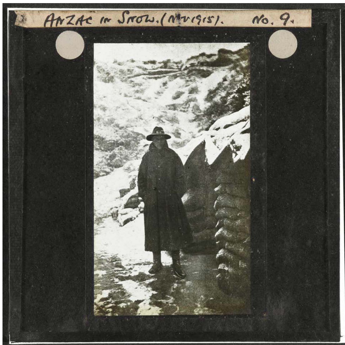
Anzac in the snow, November 1915.

During the summer months, many casualties were caused by sunstroke and flies spreading disease. As winter set in, the troops suffered from frostbite and exposure in the extreme cold.