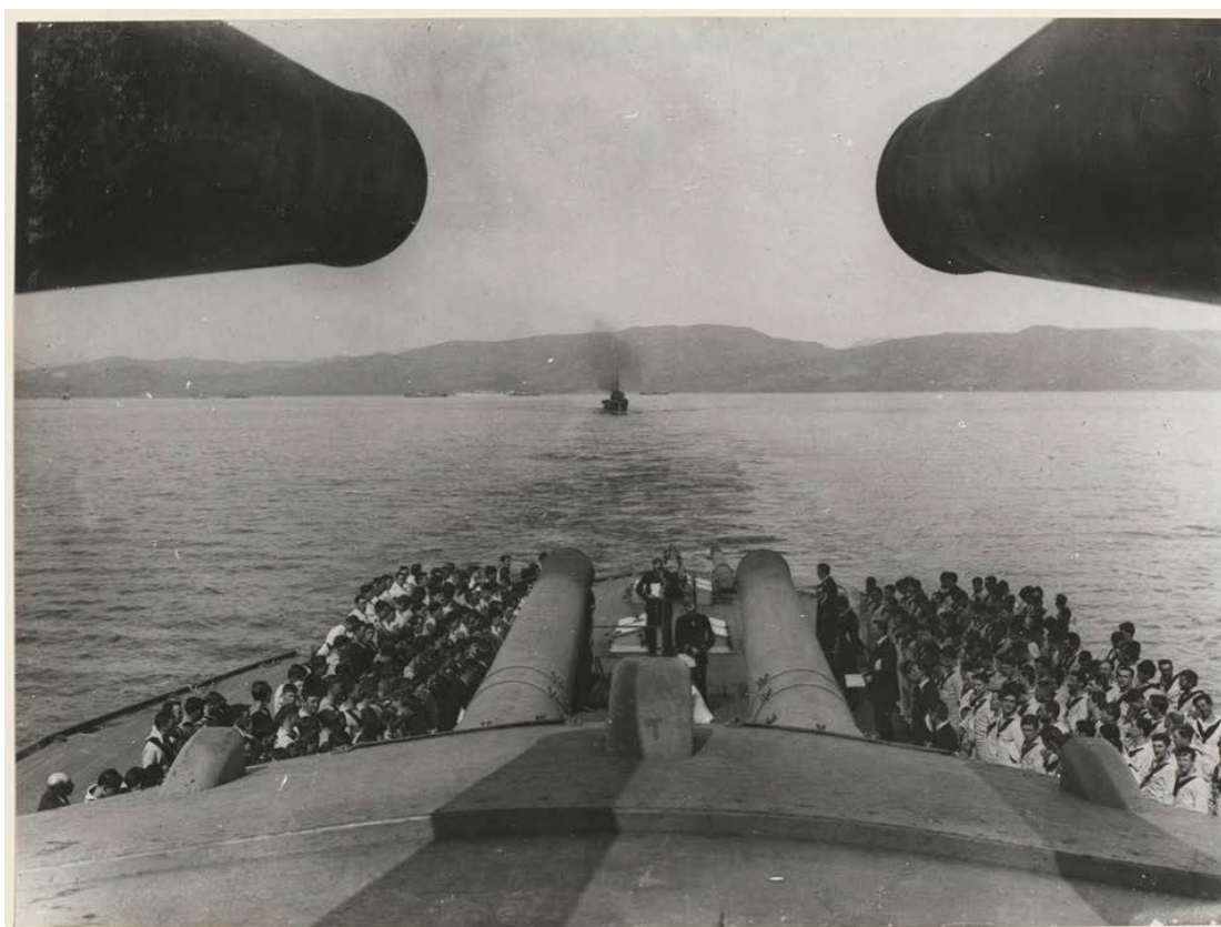
Church service on HMS 'Queen Elizabeth', 1915.

The French and British navies tried to batter the Ottoman shore fortresses into submission with heavy bombardments from their powerful guns, and they were very nearly successful, but in one disastrous day on 18 March, three capital ships were sunk and several others badly damaged when they struck sea mines in the straits. The naval attack was called off, and replaced with a land invasion on the Gallipoli Peninsula.