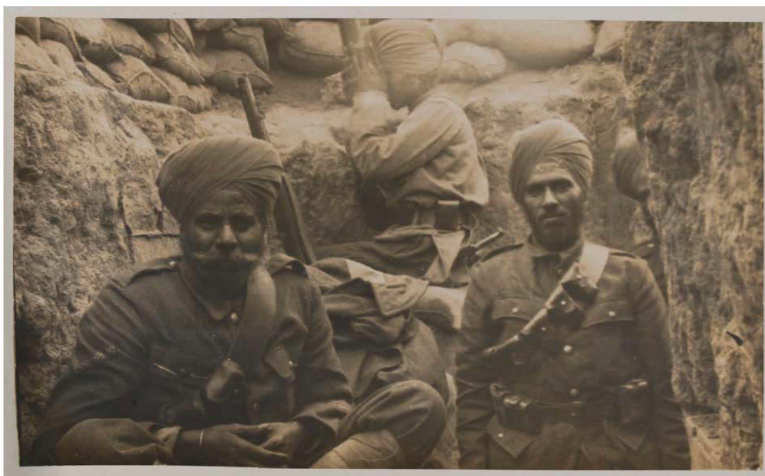
Photograph of Indian soldiers in trench, Gallipoli, 1915.