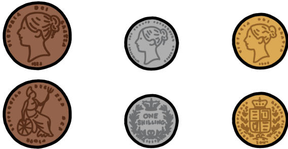
A Penny - 1d A Shilling - 1s A Pound - £1

Money in the Victorian times was different to the money we use today.