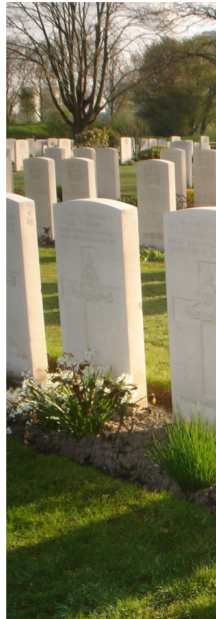
ESSEX FARM CWGC

Continue to Gare de Lille Europe for independent departures to London St Pancras (suggested Eurostar train departing at 5.34pm, arriving in London at 6.05pm)