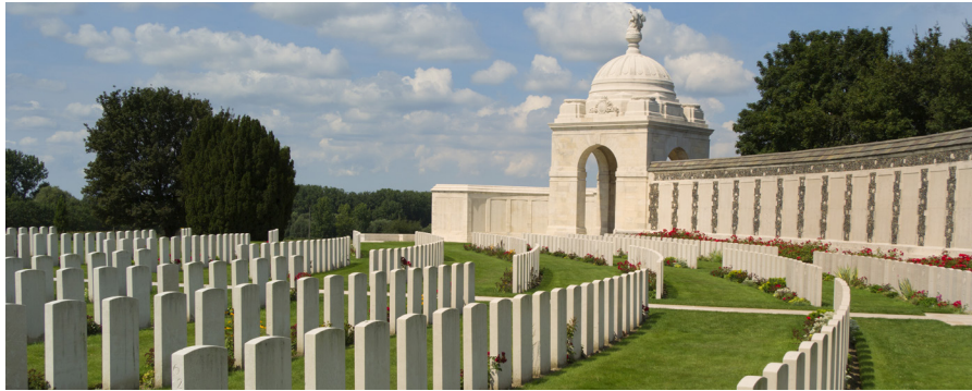
TYNE COT CEMETERY