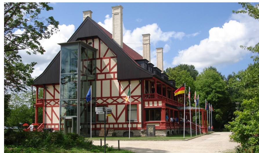
PASSCHENDAELE MEMORIAL MUSEUM

We stroll to the adjacent Koklikoo Teahouse & Bistro , the name meaning 'poppy' in Flemish. The cuisine is modern and the decor chic.