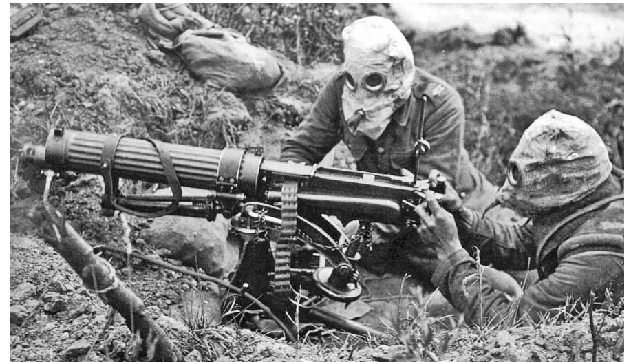
SECOND BATTLE OF YPRES, 1915