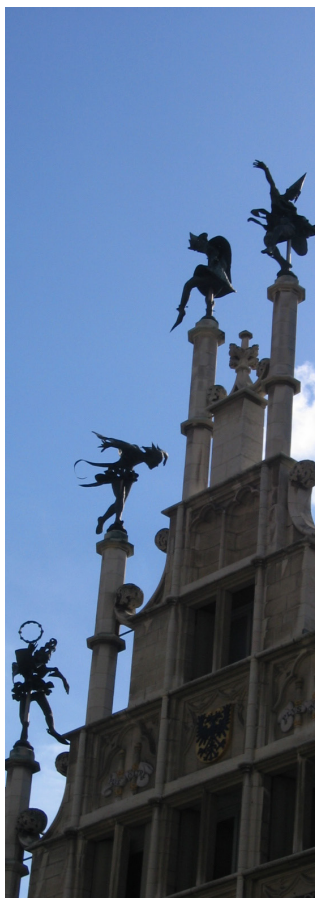
MASON'S GUILD HALL, GHENT