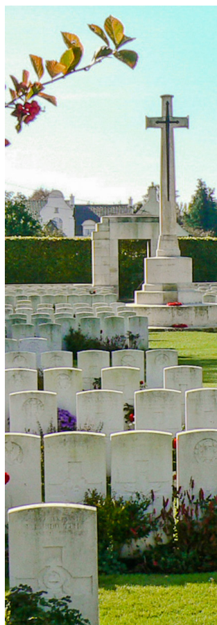
BRANDHOEK MILITARY CEMETERY

Continue to the Spanbroekmolen Mine Crater Memorial , otherwise known as 'The Pool of Peace'.