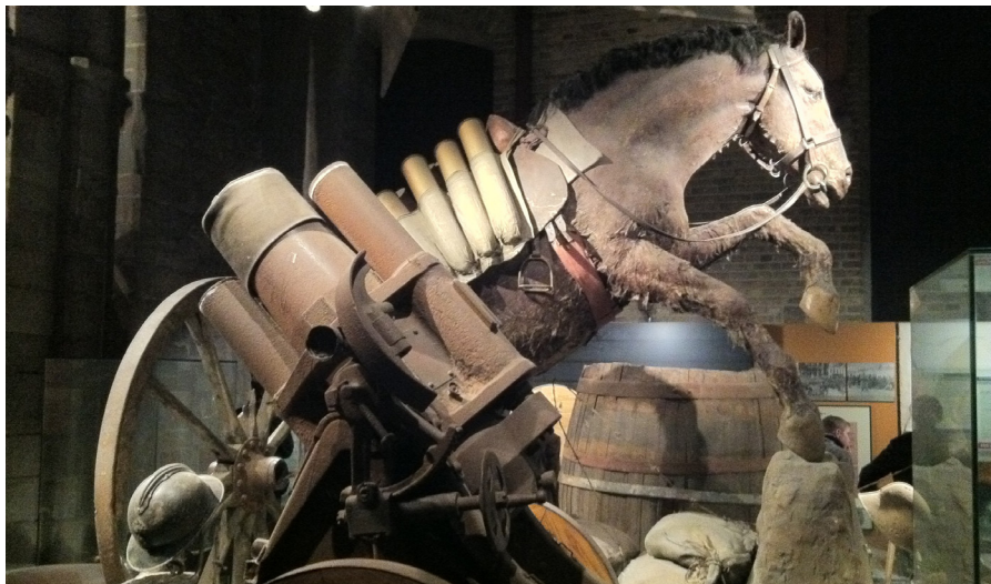
IN FLANDERS FIELD MUSEUM

We dine at the hotel's excellent Pegasus Restaurant , serving modern European cuisine in chic surroundings.