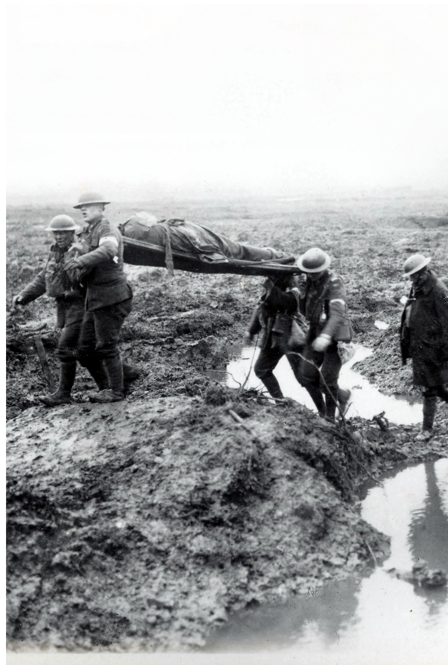
BATTLE OF PASSCHENDAELE, 1917

• Room upgrades are available – please call ArtsAbroad if you would like further information. We will also be pleased to book additional nights before or after the tour.