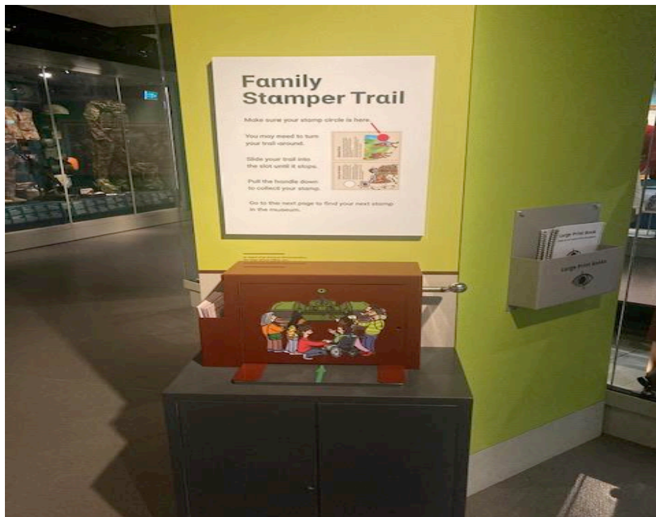
One of the Stamper Trail Stands

In support of the gallery refreshment programme, the Museum also sought to provide additional resources for our younger audience. To enhance our offerings for this segment of our visitors, the Museum installed a “stamper trail” throughout the permanent galleries. This trail serves as a family activity, encouraging interaction across the Museum. A booklet poses questions about the Army and our collections, and each stamp awarded for completing the trail depicts an object or aspect of our collections.