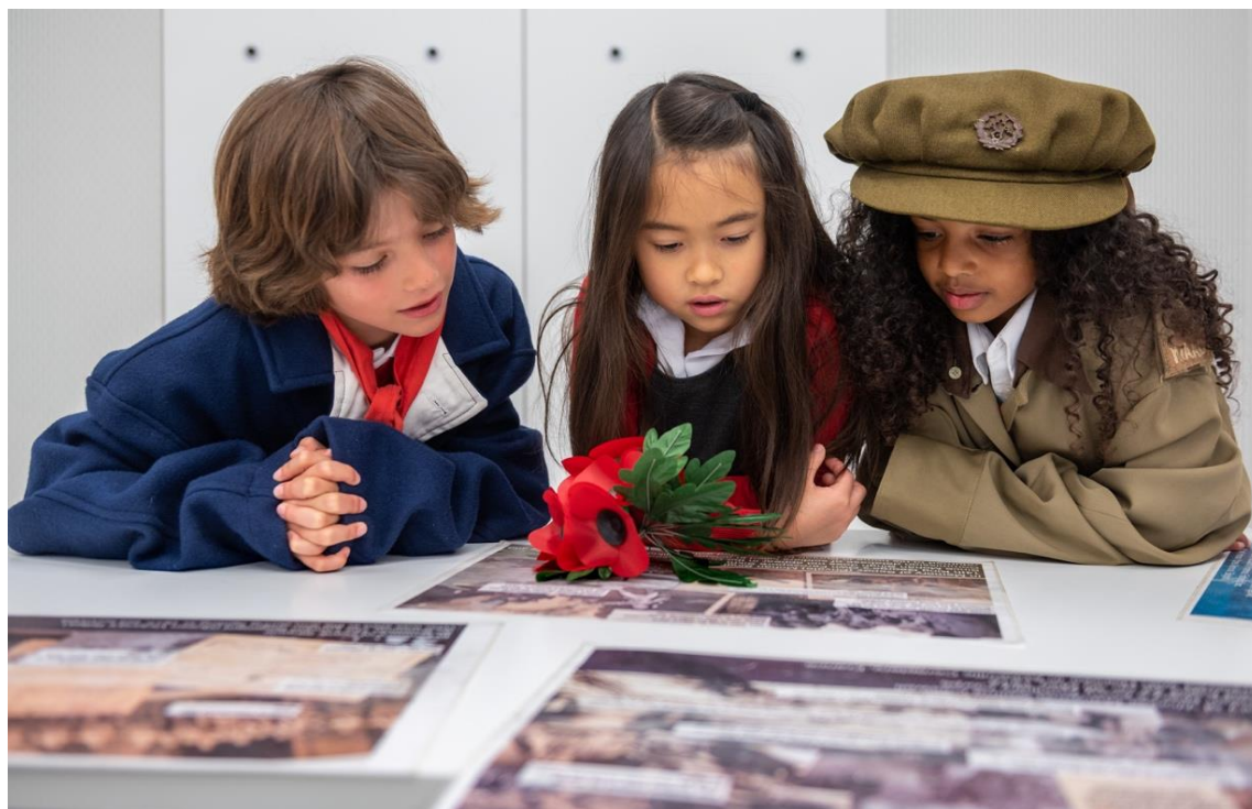
KS2 pupils take part in a workshop called ‘Poppies to Remember’