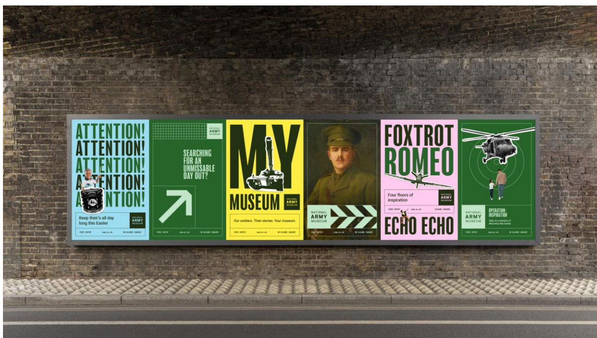
Examples of new design assets as part of the Museum brand refresh in 2024