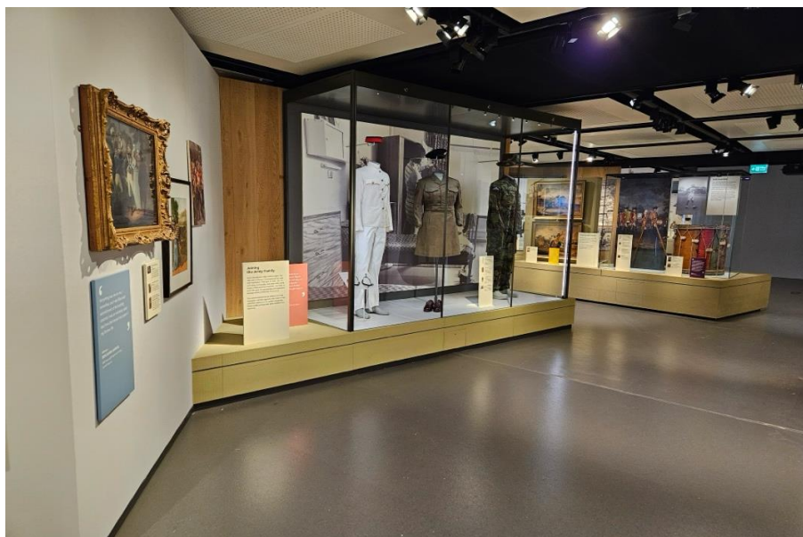
One of the many new displays in Soldier Gallery

The permanent gallery's five-year refreshment programme was nearly completed at the end of this reporting period. The Soldier Gallery, which showcases the experiences and values of soldiers in their own words, was reopened in April. This refreshment programme provided the Museum with the opportunity to rotate some of the displayed collections while simultaneously updating interactive technology. The enhanced interpretation now reflects the increased diversity and opportunities available to individuals who join the Army. As the Museum's most popular gallery, it was closed during the refreshment works. This presented an opportunity to address certain maintenance issues. Visitor feedback since re-opening has been overwhelmingly positive.