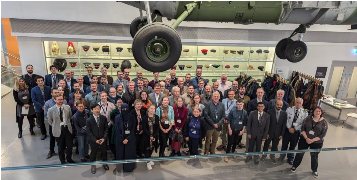
Attendees at the ICOMAM Congress

The Museum continued to collaborate with the Royal Military Academy Sandhurst (RMAS). Several RMAS researchers presented their work through the Museum's public programme, showcasing scholarship in military history and related fields. NAM curators also contributed to the edited collection Organising Warfighting , edited by RMAS experts.